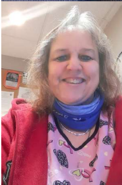
District 3 Public Health ALU Staff step up to help prepare and serve a weekend meal to residents and visitors.